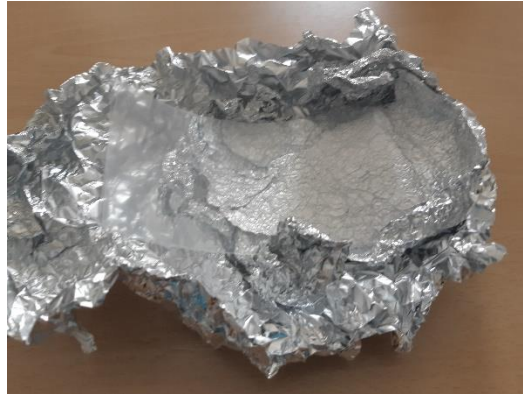
Figure 1. Olefinic polymer films wrapped in aluminium foil.

Received sample: large foils made of olefinic polymer with thickness of 180 µm.