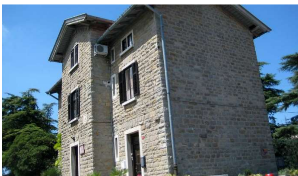
Former railway station in Izola