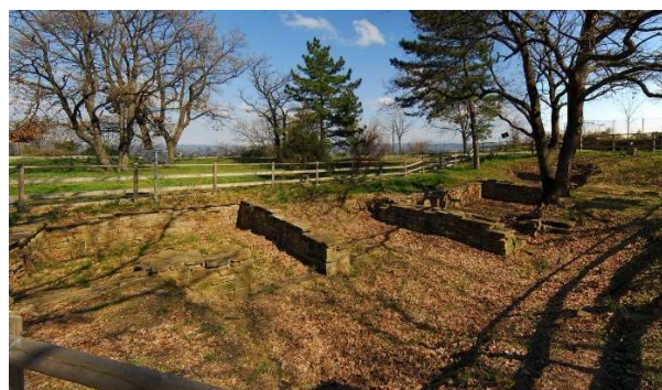
Remains of the Muggia station