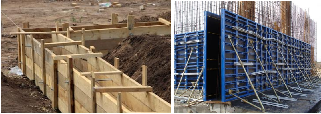
Figure 3: Wood formwork (<u>www.construire.it</u>)

Formwork (Fig. 3 and Fig. 4) is the term used for the process of creating a temporary mould into which concrete is poured and formed. Traditional formwork is fabricated using timber, but it can also be constructed from steel, glass fibre reinforced plastics and other materials. Formwork is a more complex activity than scaffolding, and the number of different industrial solutions used in these applications is very high, from simple plank wood structures to modular metal formwork up to custom designed and built special formworks. Most of the use is shared between modular wood-based formwork, laminated virgin wood or phenolic plywood, and metal structures, with faces of metal foil, plywood or fiberglass.