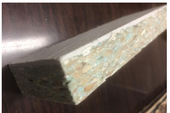
Figure 6: Layer of SMC (white) co-moulded on RFM (Gees Recycling, 2019)

Panel's strength and performances are ruled by several norms, including Italian Technical notebooks for temporary or mobile construction sites (Rossi et al., 2018). The wider applied are EN 12810-12811 1 & 2 (Table 1) where load classes according to EN-12811-1 are shown. In Fig. 7, types of load testing required are shown. These requirements are important, wood products normally reach class 2, higher classes requires metal or continuously supported panels with I-Beams.