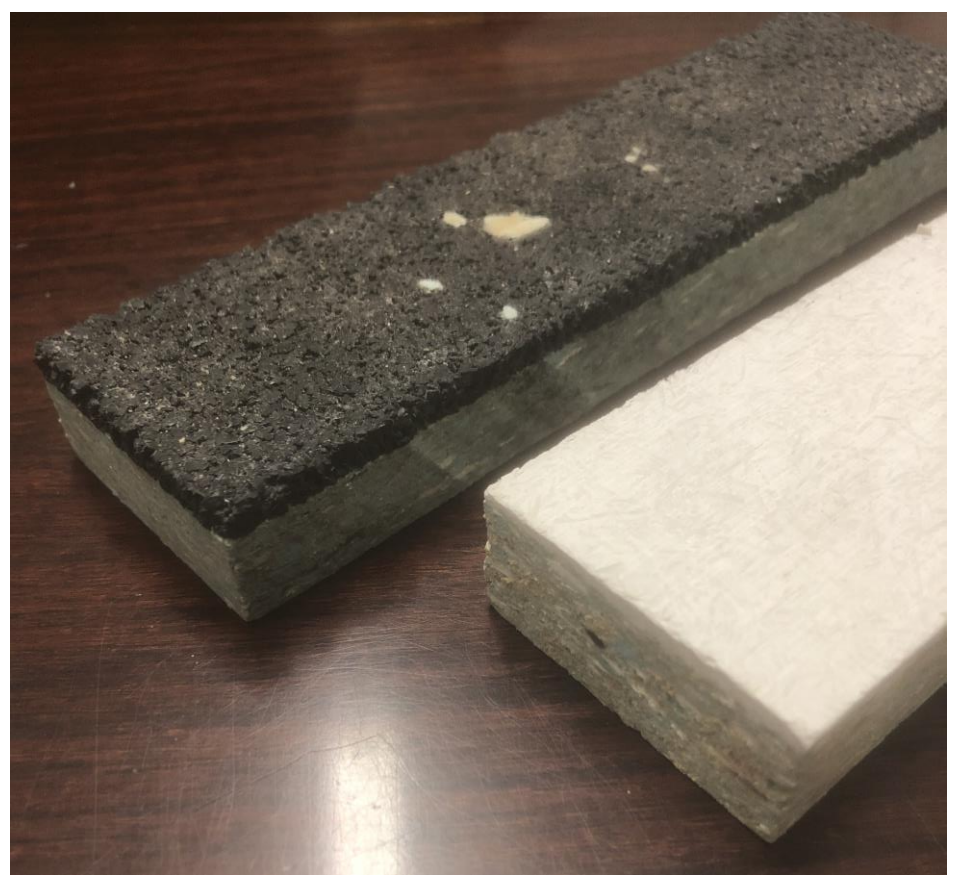
Figure 5: Left co-moulded Recycled Fibre Material (RFM) & recycled rubber, right co-moulded RFM & SMC (Gees Recycling, 2020)

After testing with Polyvinyl chloride (PVC) and recycled rubber sheets (Fig. 5), which showed good results that will be exploited in different sectors, an interesting opportunity arose, when a reputed composites company, Polmix Srl based in Busto Arsizio, pioneer in producing Sheet Moulding Compound (SMC) and Bulk Moulding Compound (BMC), asked Gees Recycling to find a recycling option for out-of spec uncured SMC and BMC. These fibre-reinforced materials could be processed in the recycling line since the polymerizing parameters (heat and pressure) are not so different.